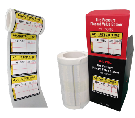
Actual Size - 100 Stickers per Box